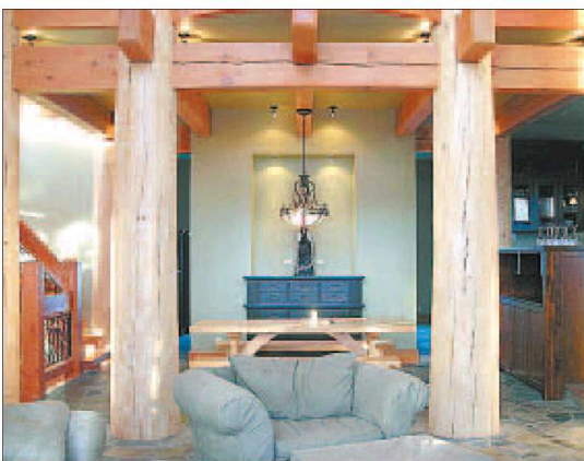
Huge fir beams, wood details and rock accents, along with three fireplaces, give the home a solid, rugged feel.

Huge fir beams, wood details and rock accents (not to mention three fireplaces) create a solid feeling.